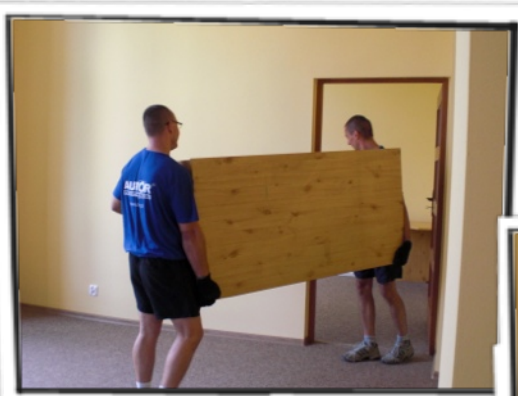
Above and Right: Getting the Place Ready

September 8th 2012 is also the first day of school for CBC Poland. This is tremendous! We have been preparing for this day for the last 2 years. So much work has been done up to this moment - editing transcripts for translation into Polish, actual translation into Polish, verification of translations, learning DVD / Video technology, creating DVDs with subtitles. The list goes on and on. (Attached pictures will give you an idea of what we have been doing just this summer). Much more remains to be done in the future. But we are so jazzed at achieving this milestone that we want to share this great moment with you.