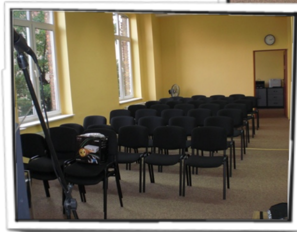
Right: First Year Classroom