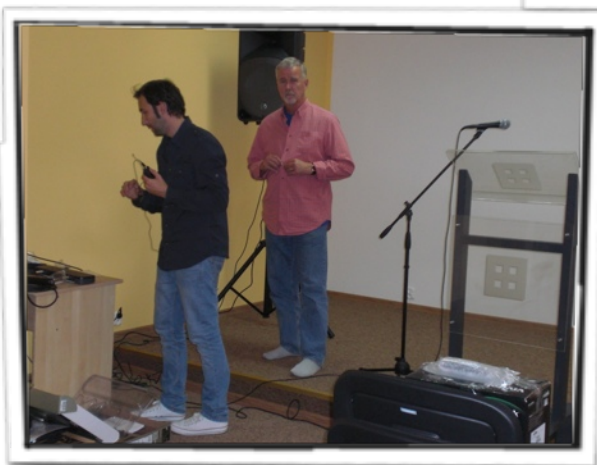
Left: Setting Up the Sound System Right: Making DVDs with Subtitles