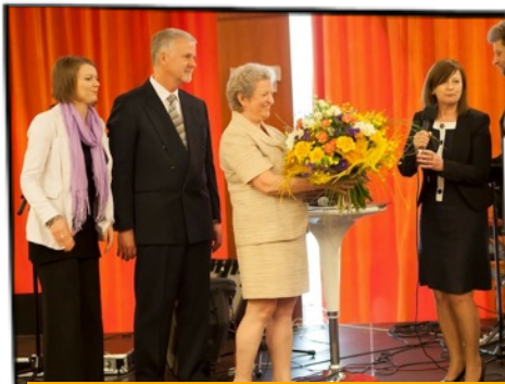
Receiving flowers from the 1st year students