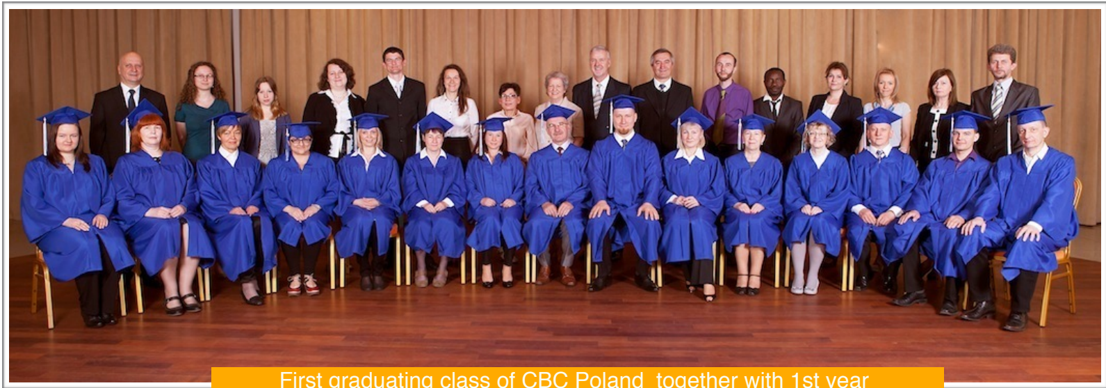
First graduating class of CBC Poland together with 1st year

One of our students was in the hospital during the graduation celebration giving birth to her son and was not included in the group picture, so we went to the hospital and delivered her diploma to her.