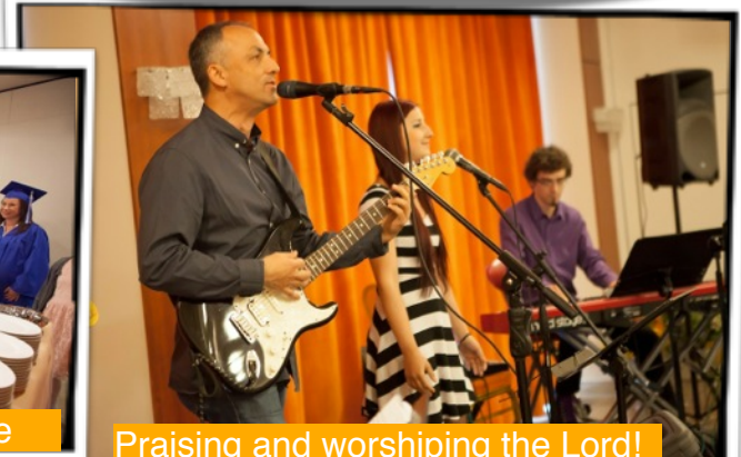
Praising and worshipping the Lord!