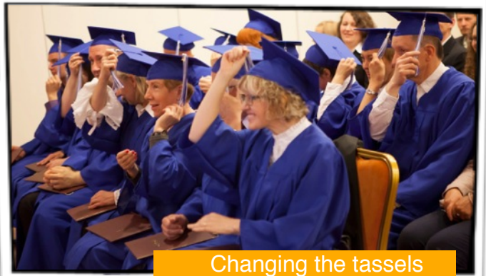
Changing the tassels