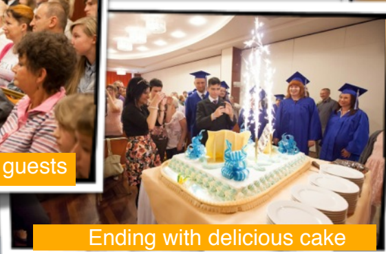
Ending with delicious cake