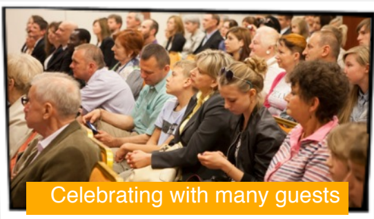
Celebrating with many guests